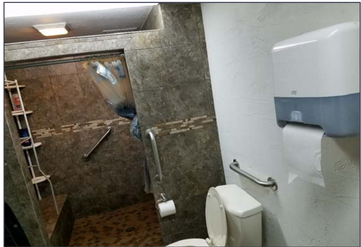
Restroom with tiled shower