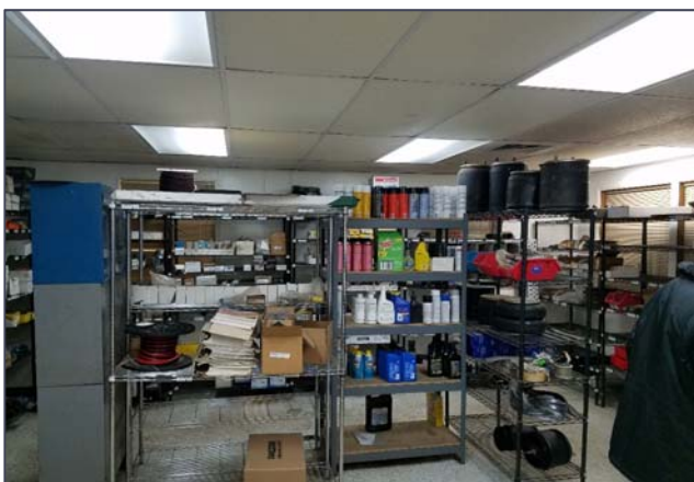
Tool & parts crib