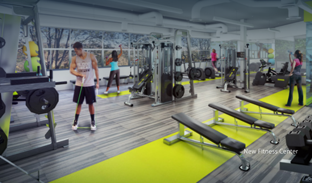
New Fitness Center