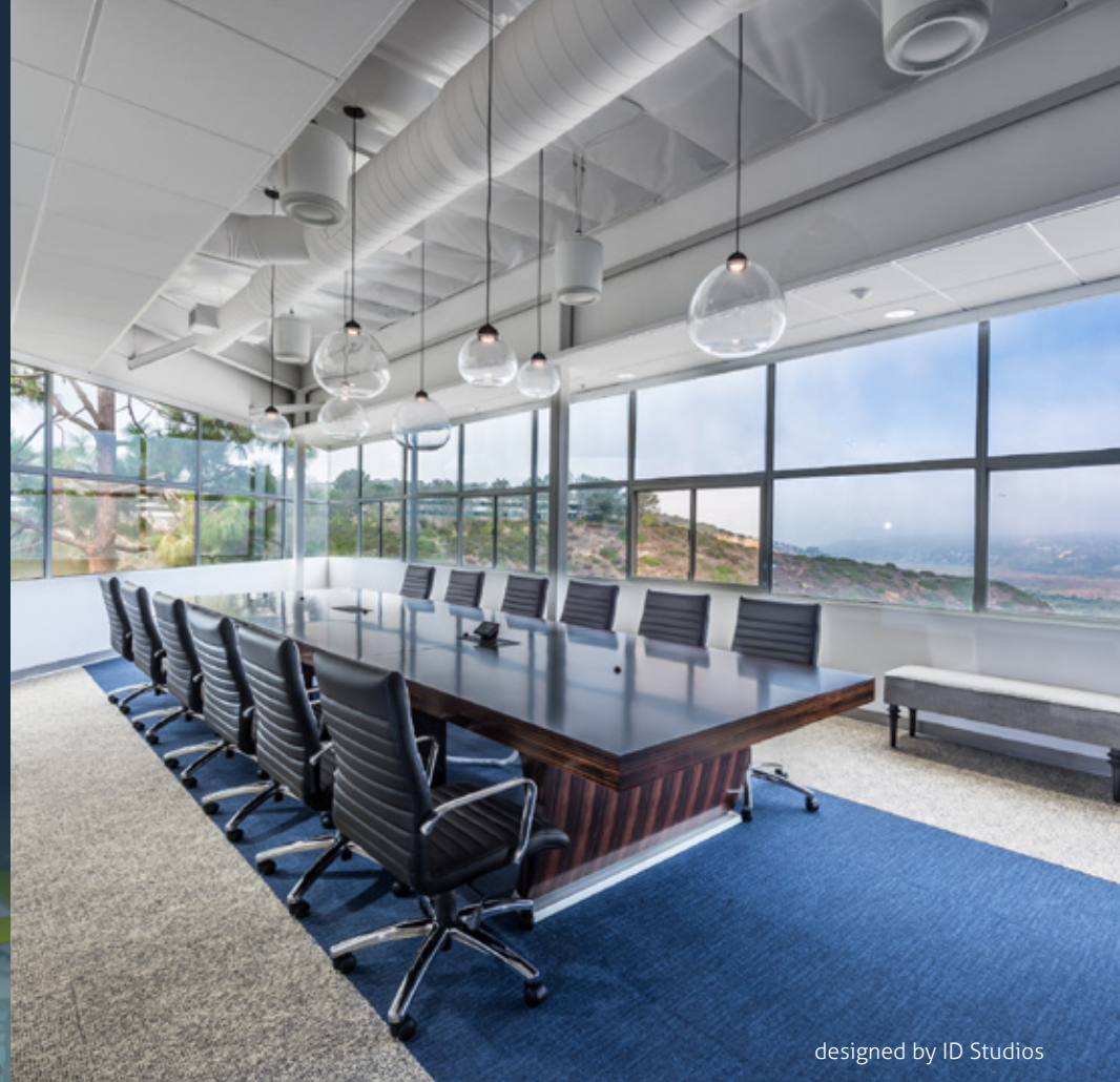
designed by ID Studios