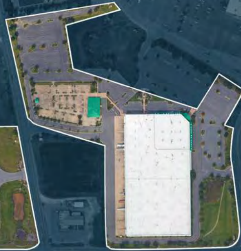
1203 Lycoming Mall Circle 235,000 SF | 21.33 Acres