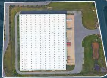
490 S. Lycoming Mall Road 198,000 SF | 10.97 Acres