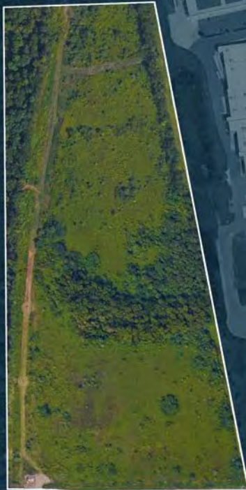
31.54 Acres KOZ designated site