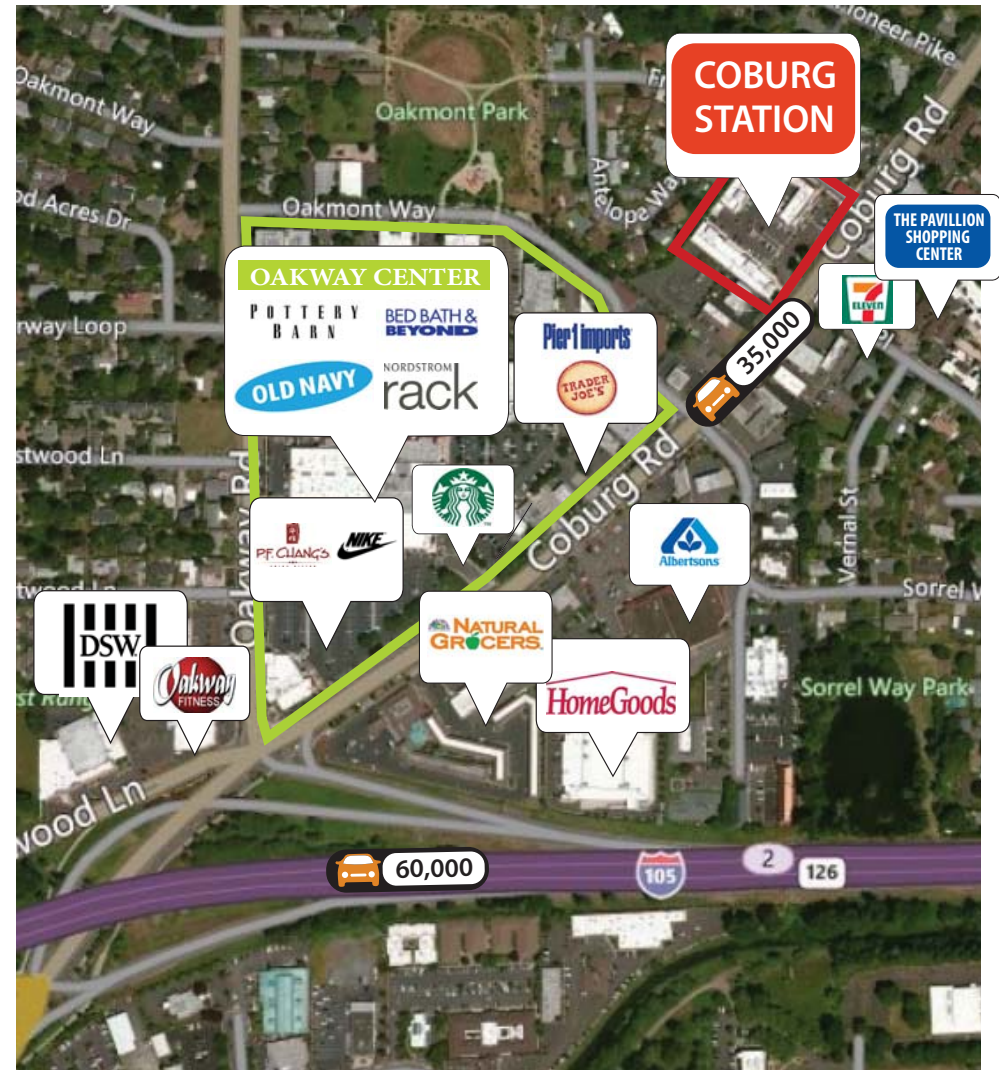
COBURG ROAD SHOPPING CORRIDOR

Coburg Station located on Coburg Rd has daily traffic counts of 35,000. The shopping center also has easy access to and from I-5 with daily counts of over 60,000.