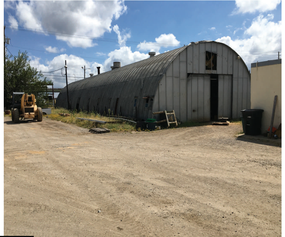
5,200 SF Quonset Hut