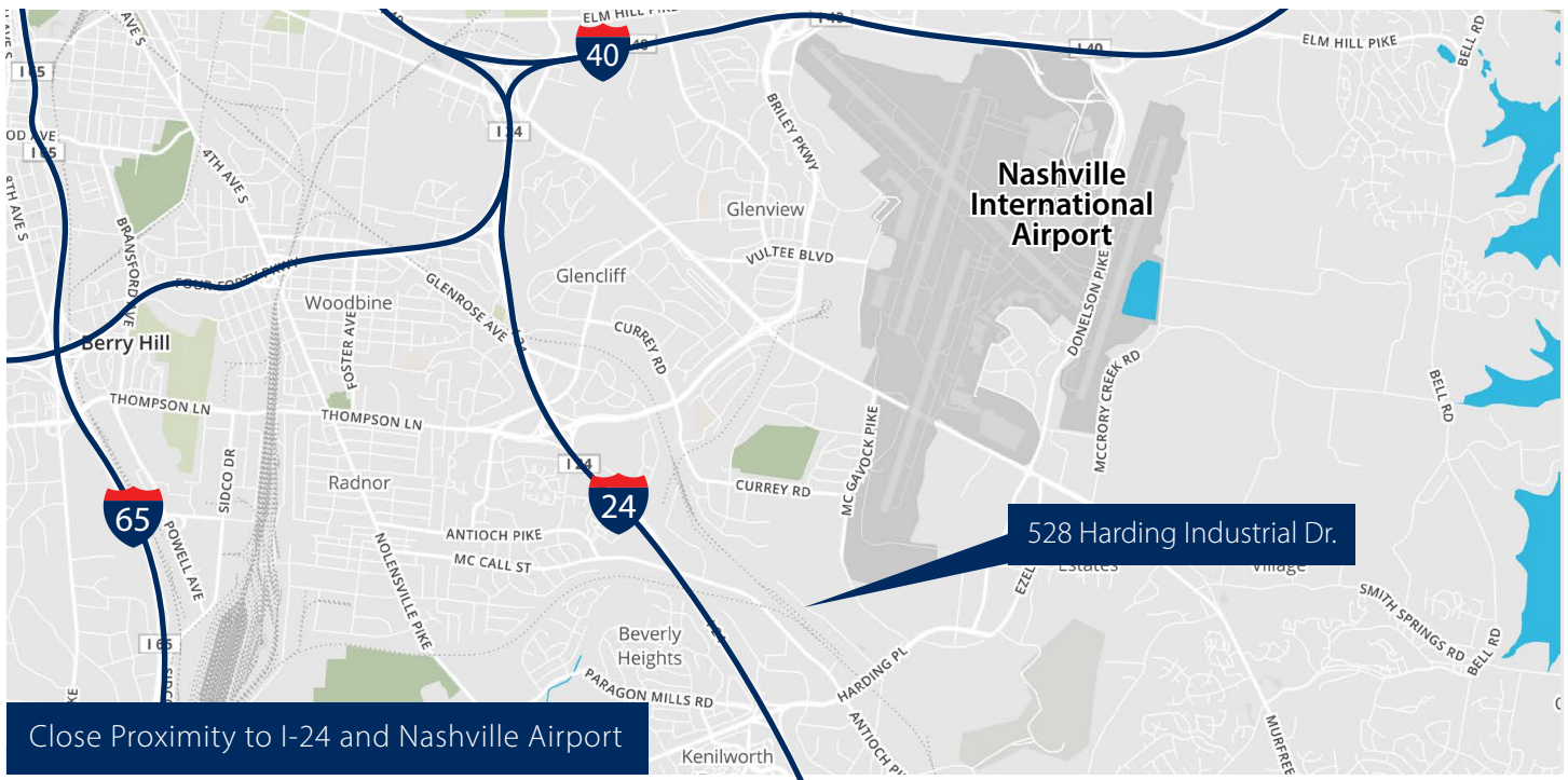
Close Proximity to I-24 and Nashville Airport