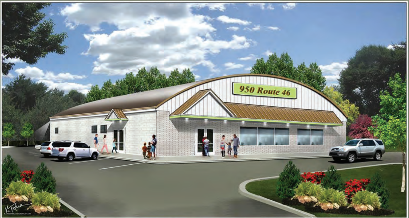
950 Route 46 Roxbury Township, New Jersey