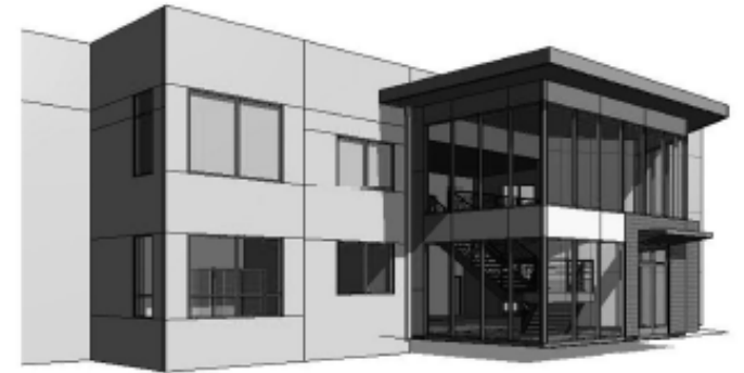
VIEW FROM PARKING