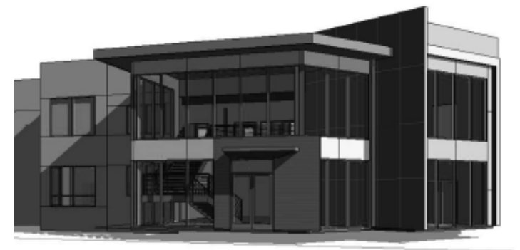
VIEW FROM ENTRY