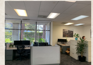
Open Work Area