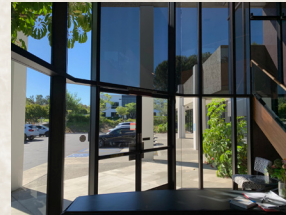
Ground Floor Lobby