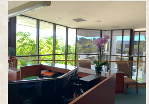
Second Floor Lobby