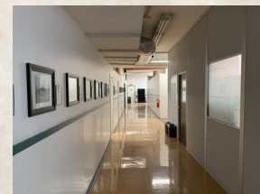
Partial Built Out Warehouse