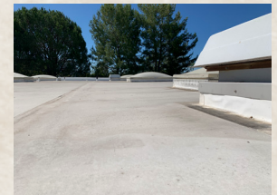
Recently Replaced Roof