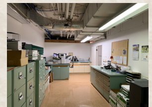
Partial Built Out Warehouse