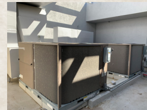
New HVAC Units