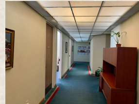
Private Office Corridor