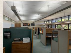
Open Work Area