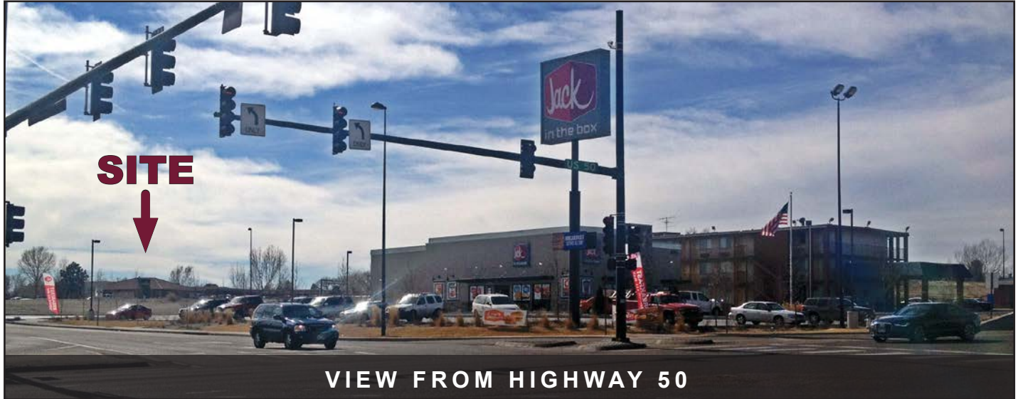
VIEW FROM HIGHWAY 50