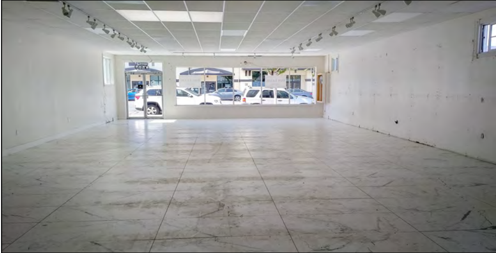
Large Windows, Tile Floor and Drop Ceiling

2082 S. Winchester Boulevard • Campbell, CA 95008