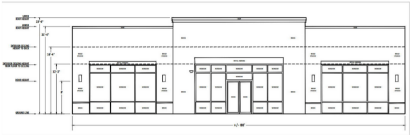
③ STOREFRONT ELEVATION