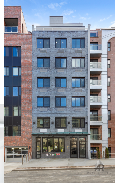
Ground Floor Space