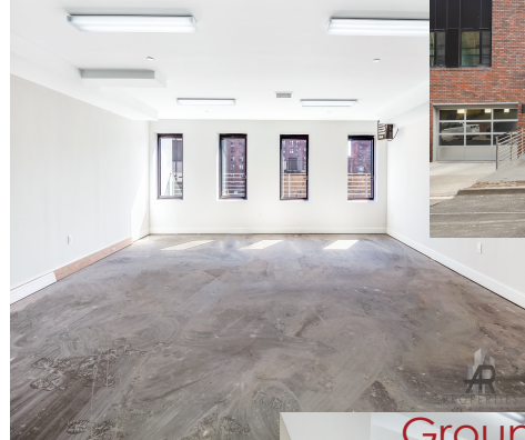
Lower Level Space