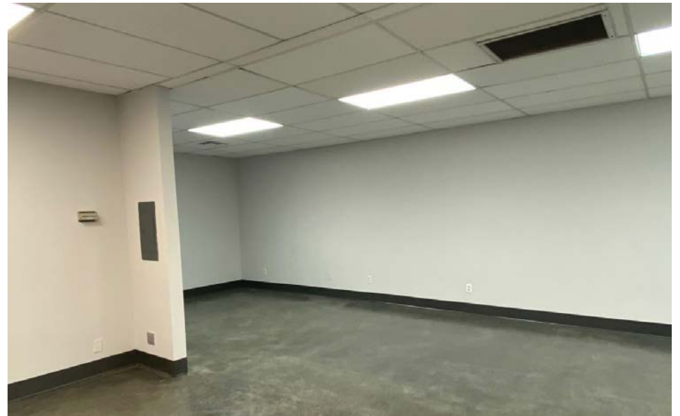
PHOTOS - SUITE 104