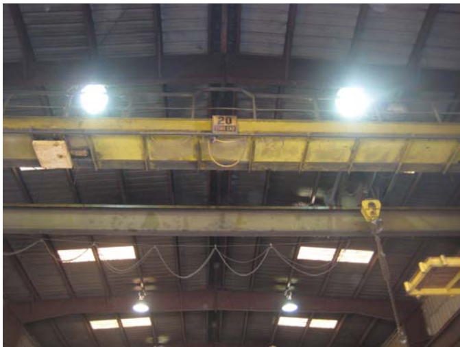
20-Ton Bridge Crane