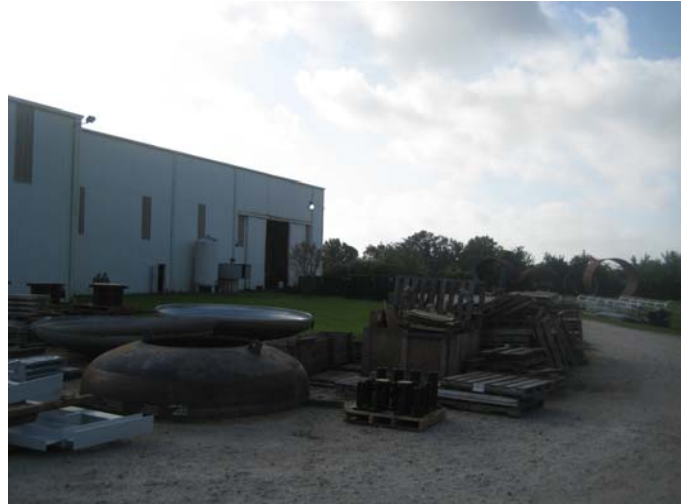
West Side Yard