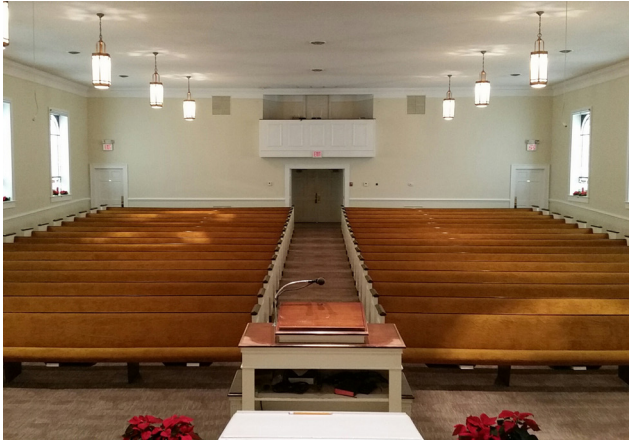
Sanctuary Front View