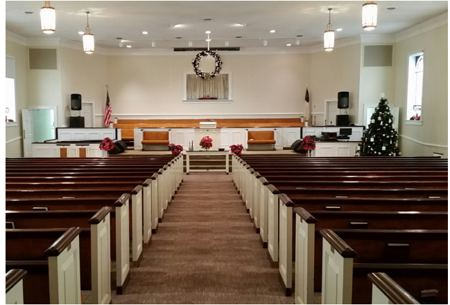
Sanctuary Rear View