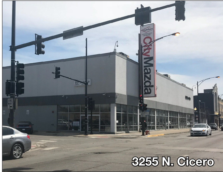
3255 N. Cicero

(312) 338-3003 | dhyman@mpirealestate.com