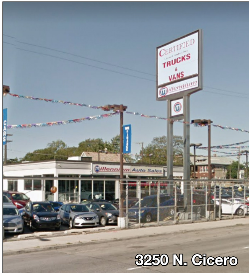
3250 N. Cicero