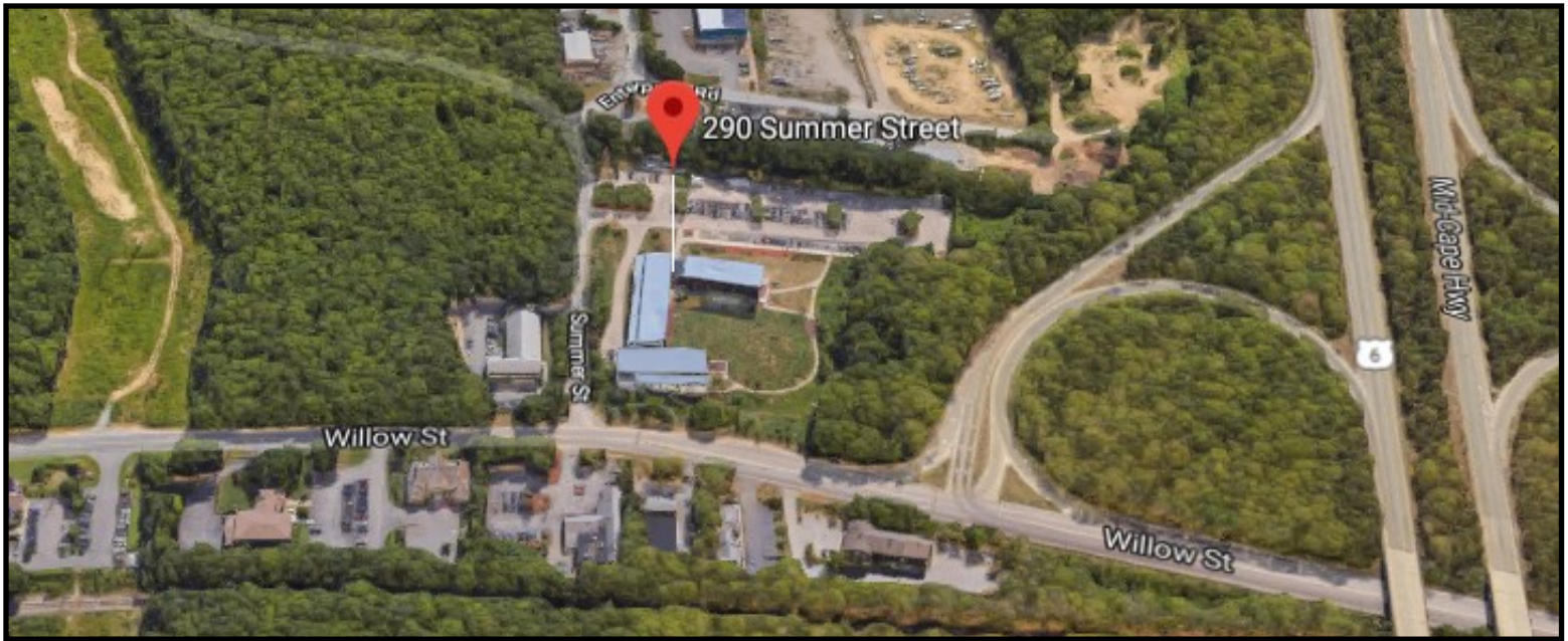
Located off exit 7 from the Mid-Cape Highway, MA-Route 6.