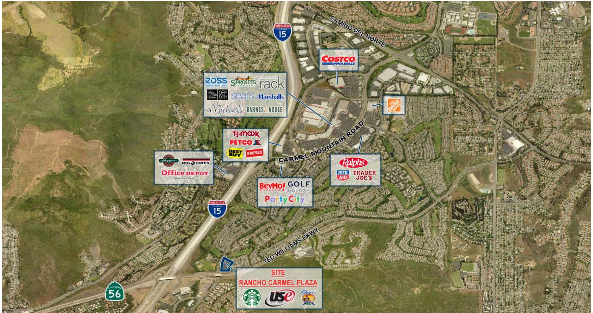
TENANTS IN THE MARKET AERIAL