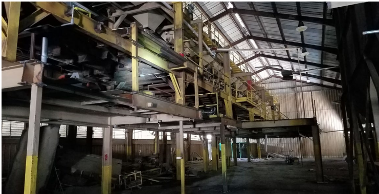
HIGH CEILING BUILDING