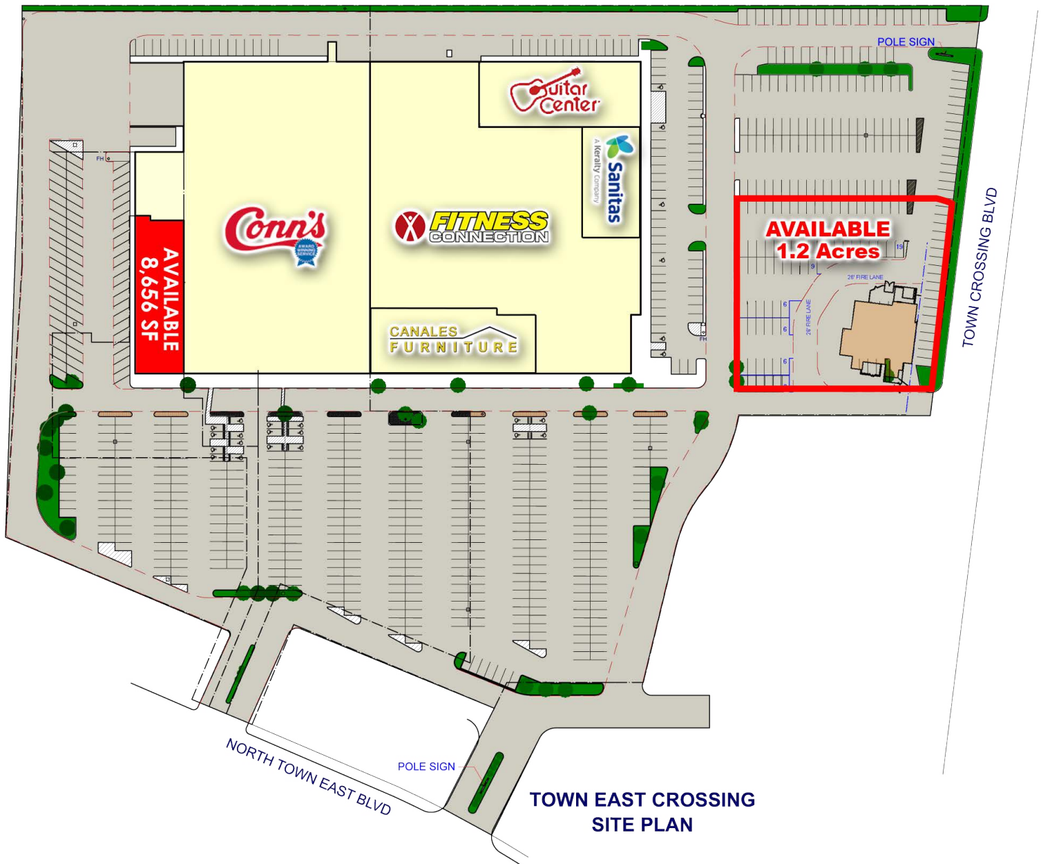
TOWN EAST CROSSING SITE PLAN