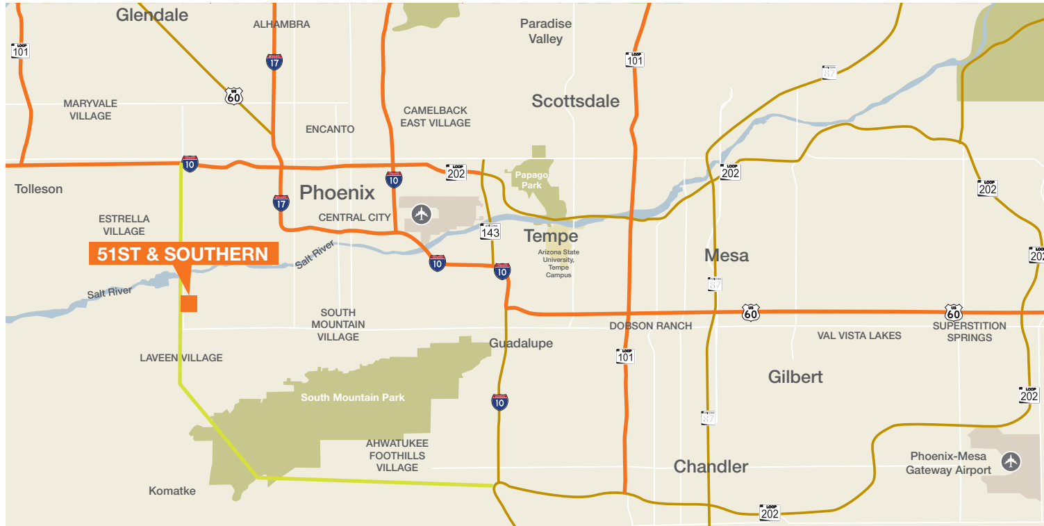
— NEW PROPOSED LOOP 202 SOUTH MOUNTAIN FREEWAY