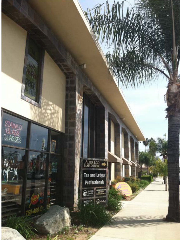
EXCELLENT VISIBILITY AND PARKING