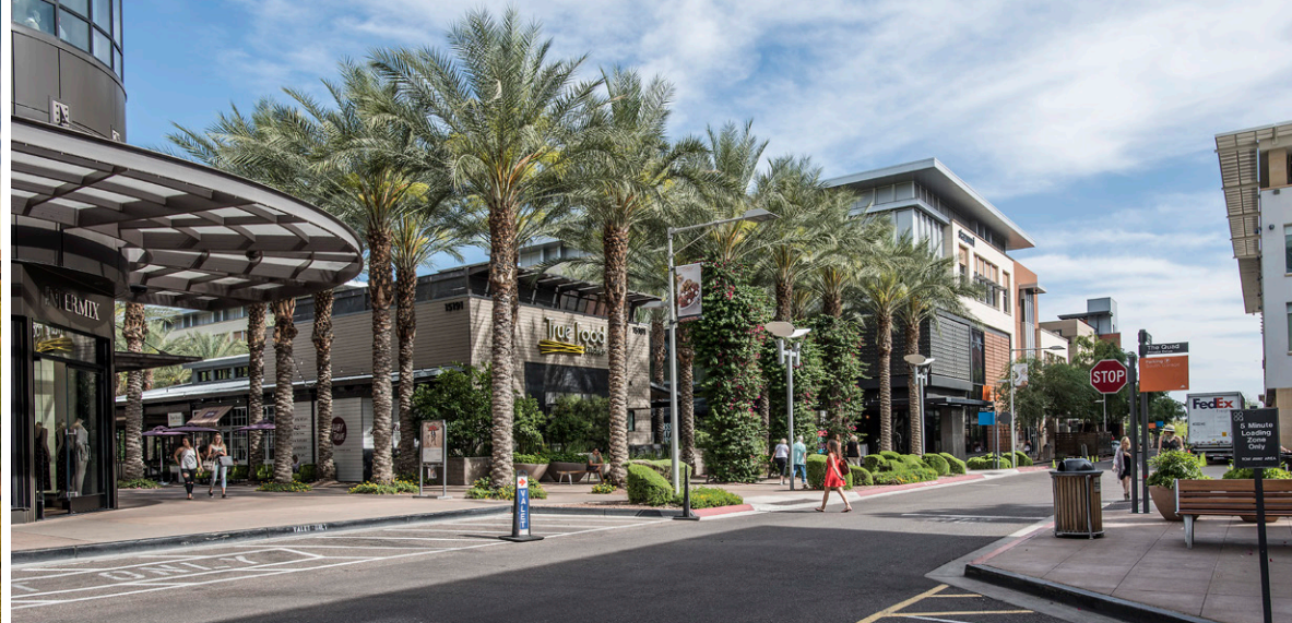
SCOTTSDALE QUARTER | ±75 ON-SITE AMENITIES