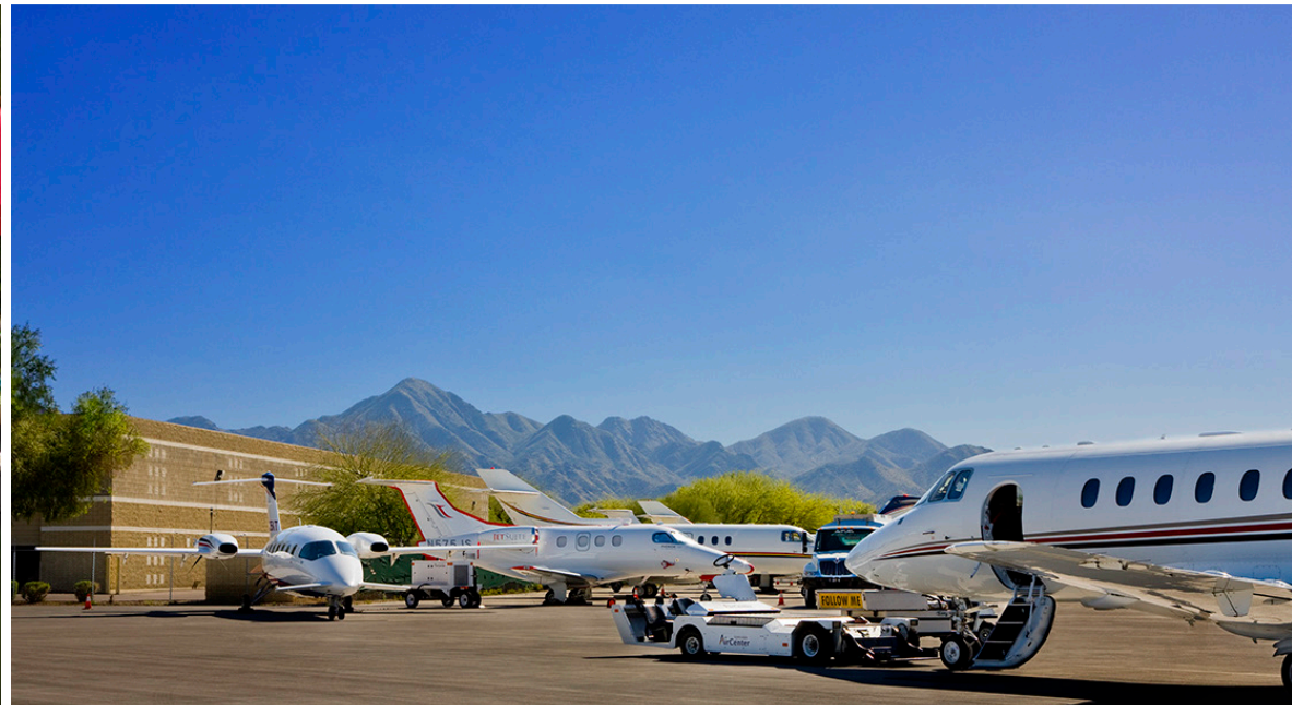
SCOTTSDALE AIRPARK | BUSIEST SINGLE-RUNWAY PRIVATE AIRPORT IN THE COUNTRY