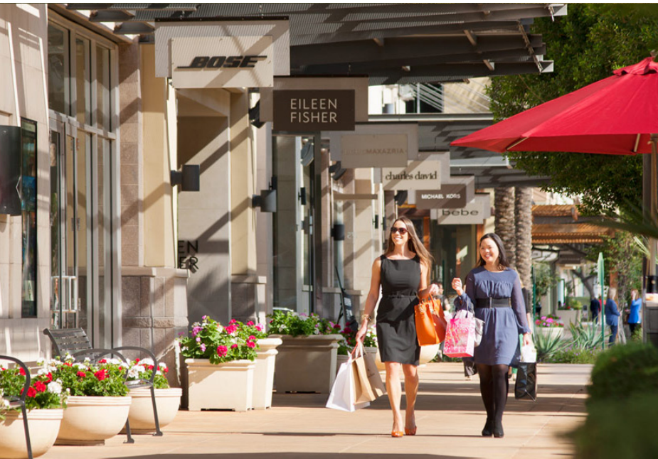
KIERLAND COMMONS | ±1M SF LIFESTYLE CENTER