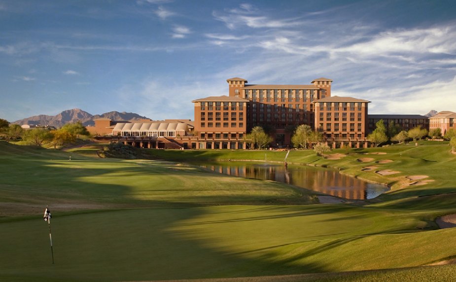
WESTIN KIERLAND | ONE OF THE “2017 ARIZONA GOLF COURSES OF THE YEAR”