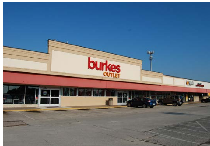
Recently completed new fascia