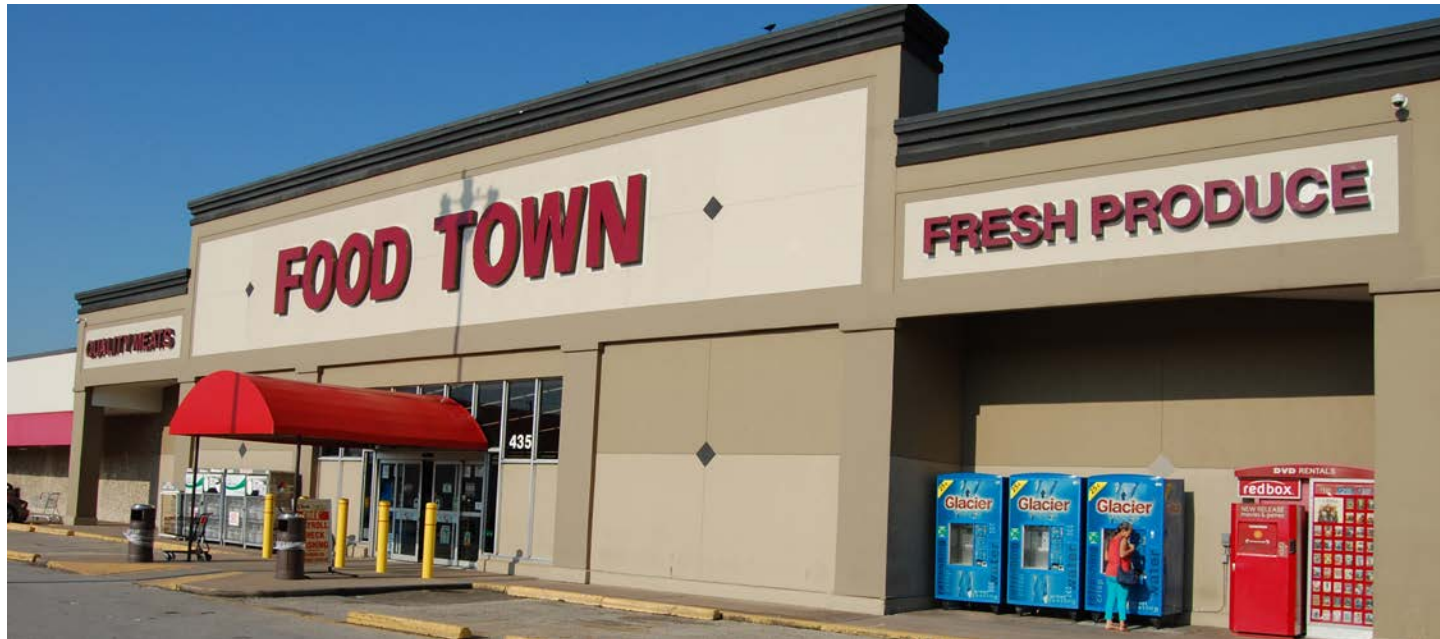
THE Channelview grocery store