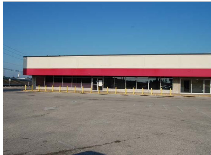
Endcap/Junior Box Available