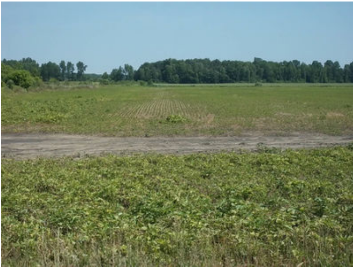
Macomb Town Center Picture