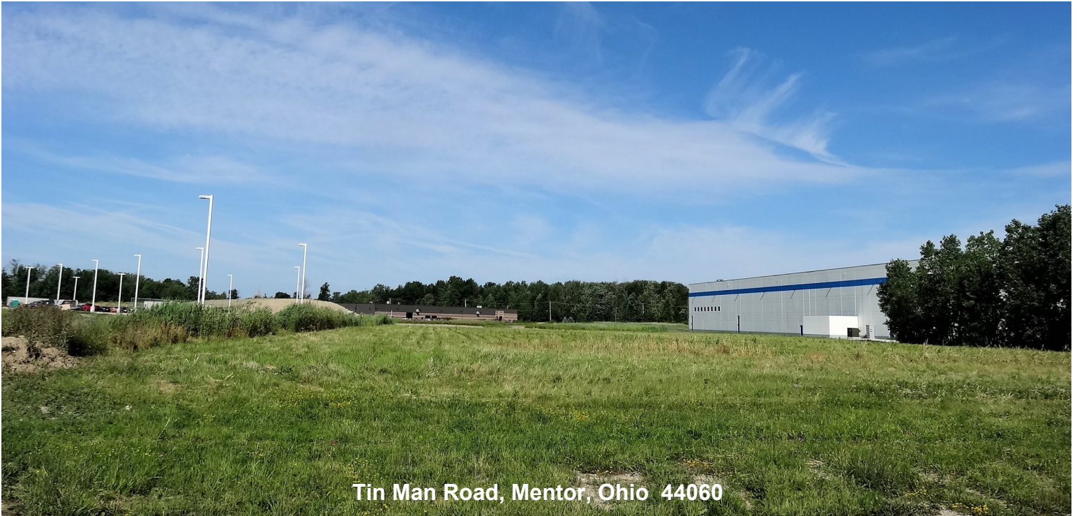
Tin Man Road, Mentor, Ohio 44060