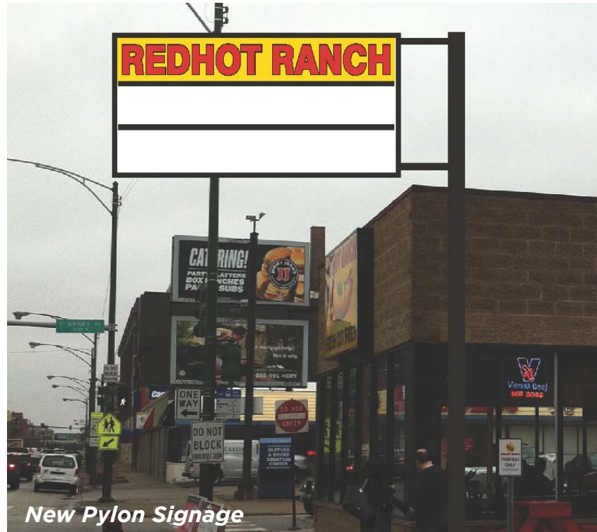
New Pylon Signage