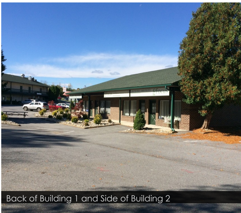
Back of Building 1 and Side of Building 2