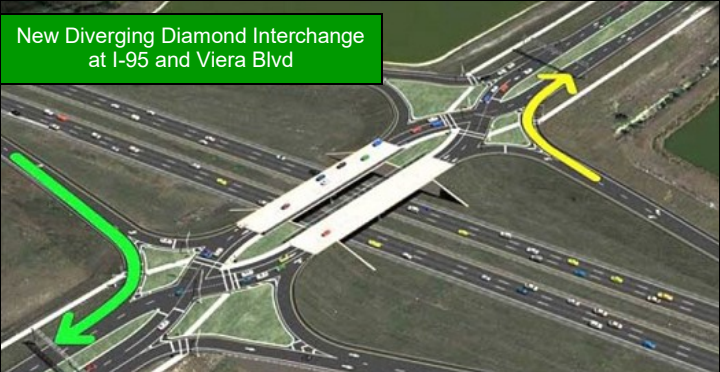
New Diverging Diamond Interchange at I-95 and Viera Blvd