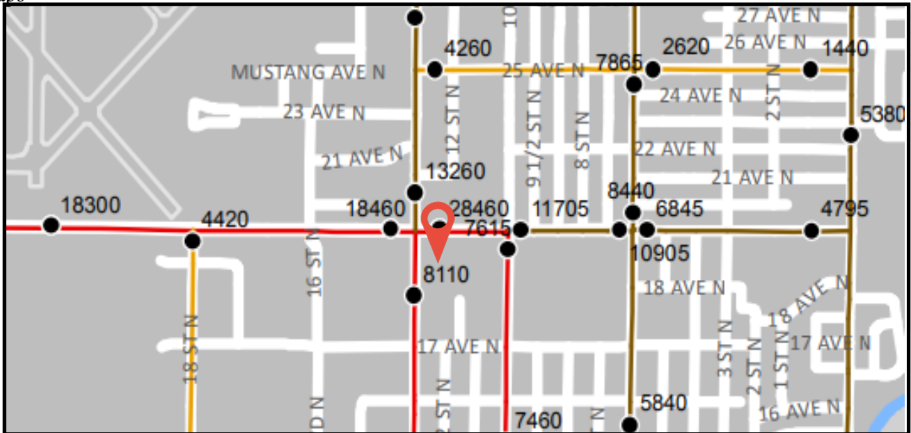
Fargo-Moorhead Metro Cog