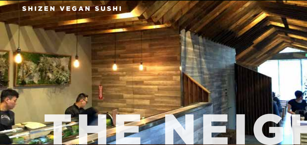
SHIZEN VEGAN SUSHI