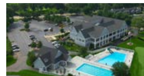
Cress Creek Country Club