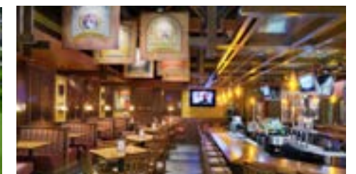
Rock Bottom Restaurant

All information contained herein is from sources deemed reliable and is submitted subject to errors, omissions and to change of price or terms without notice.