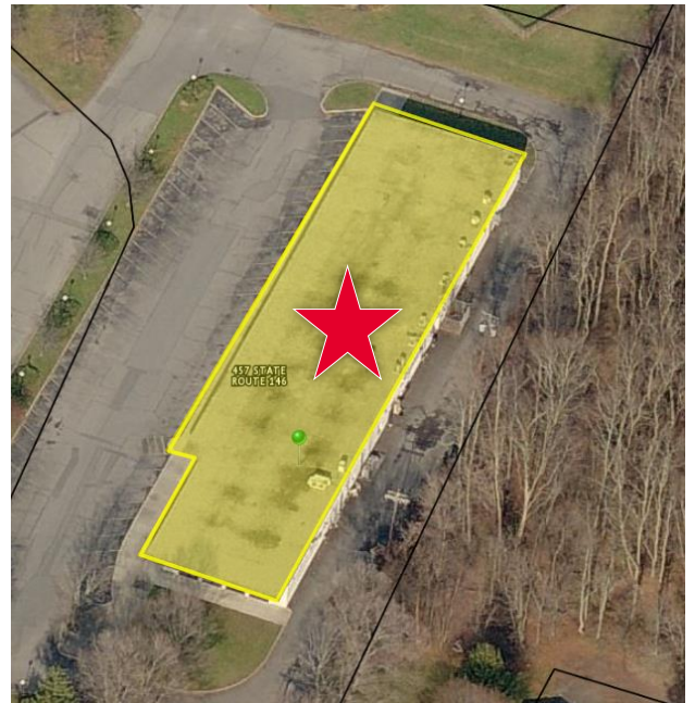
Plot lines approximate; subject to survey verification