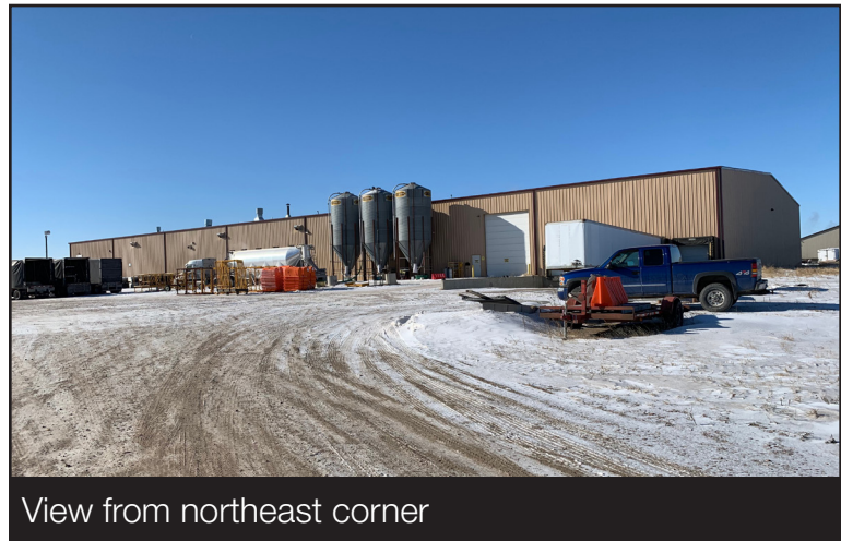
View from northeast corner