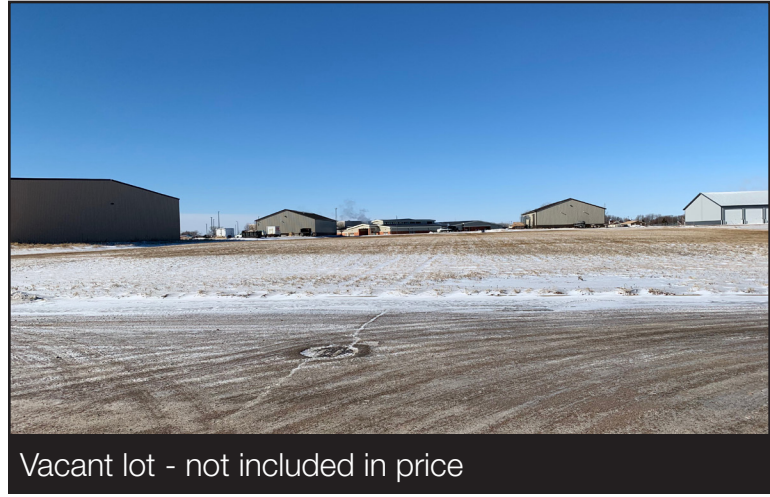
Vacant lot - not included in price