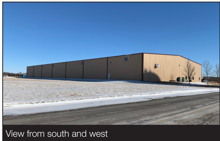
View from south and west