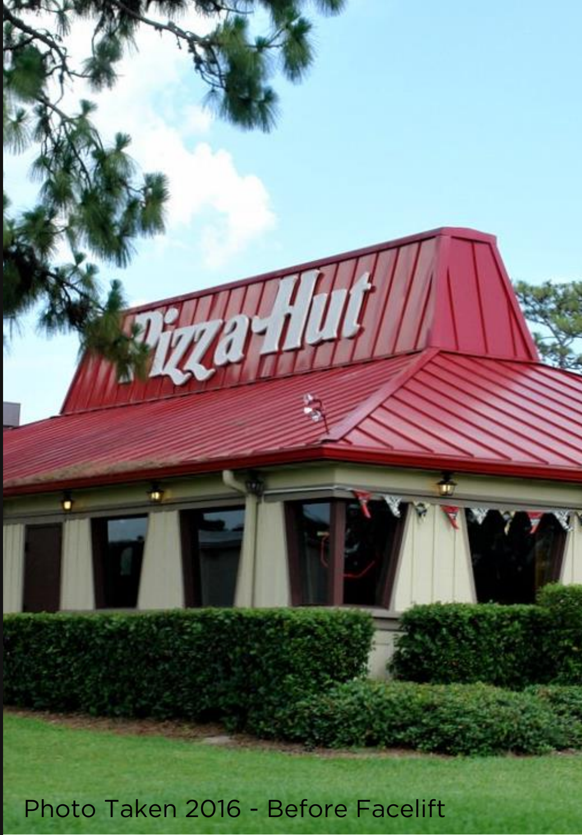
Photo Taken 2016 - Before Facelift