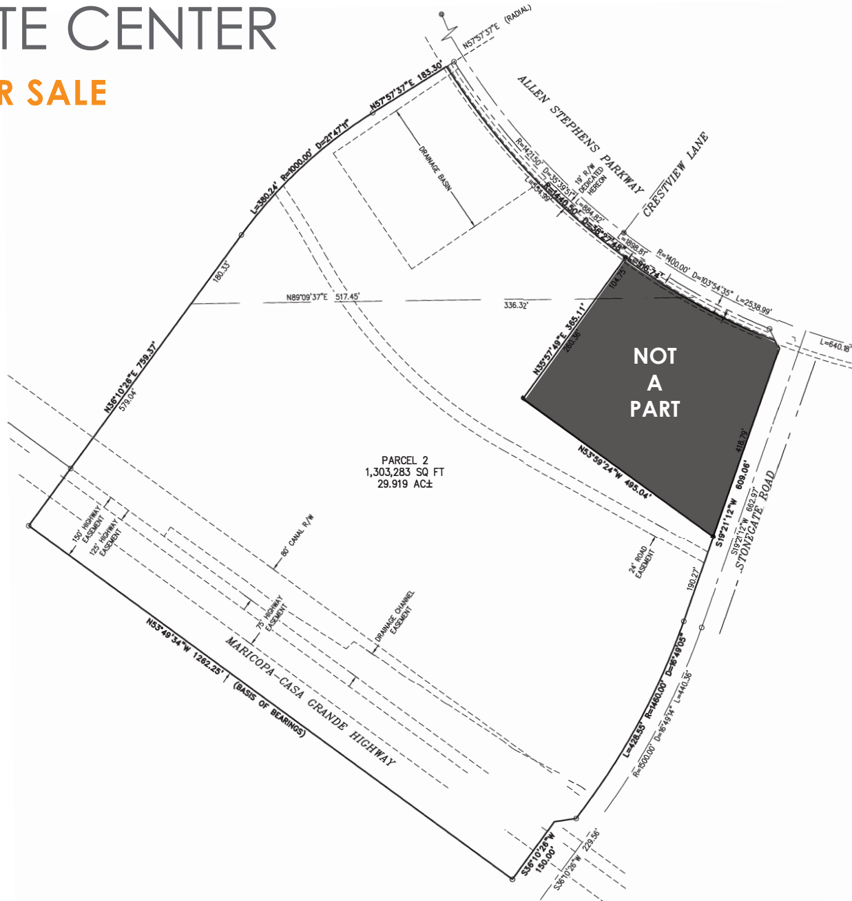
Conceptual site plan (Not to Scale)