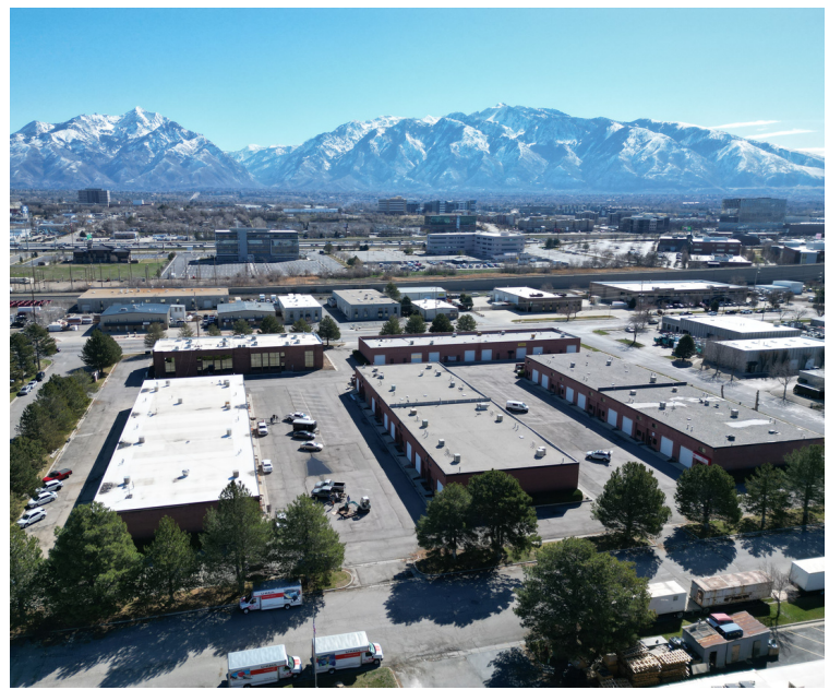
This information is given with the understanding that all negotiations and/or real estate activity related to the property described above shall be conducted through this cRc Nationwide office. The above information while not quaranteed, was obtained from sources we believe to be reliable.