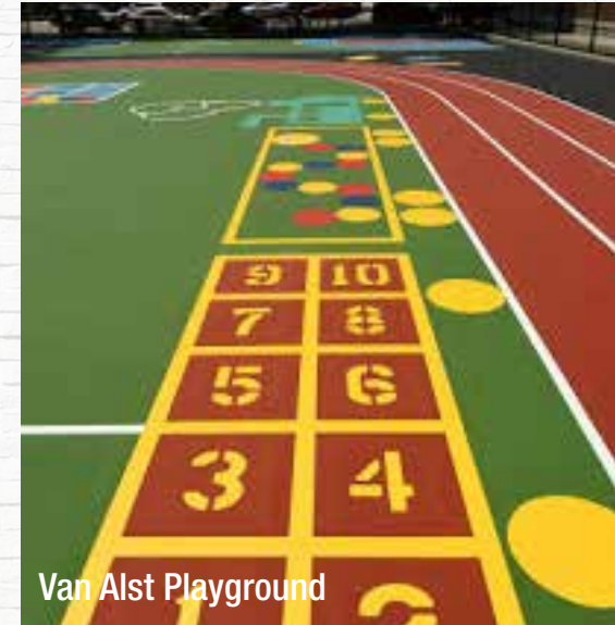
Van Alst Playground