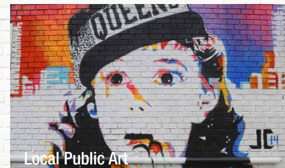
Local Public Art