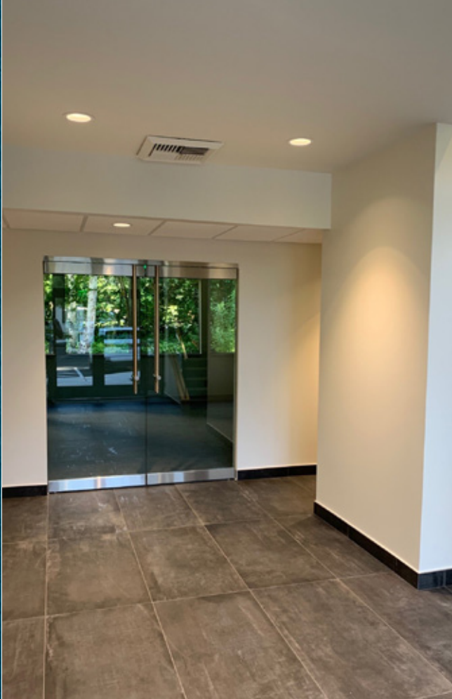
DOUBLE-GLASS DOOR ENTRANCE TO SUITE 120