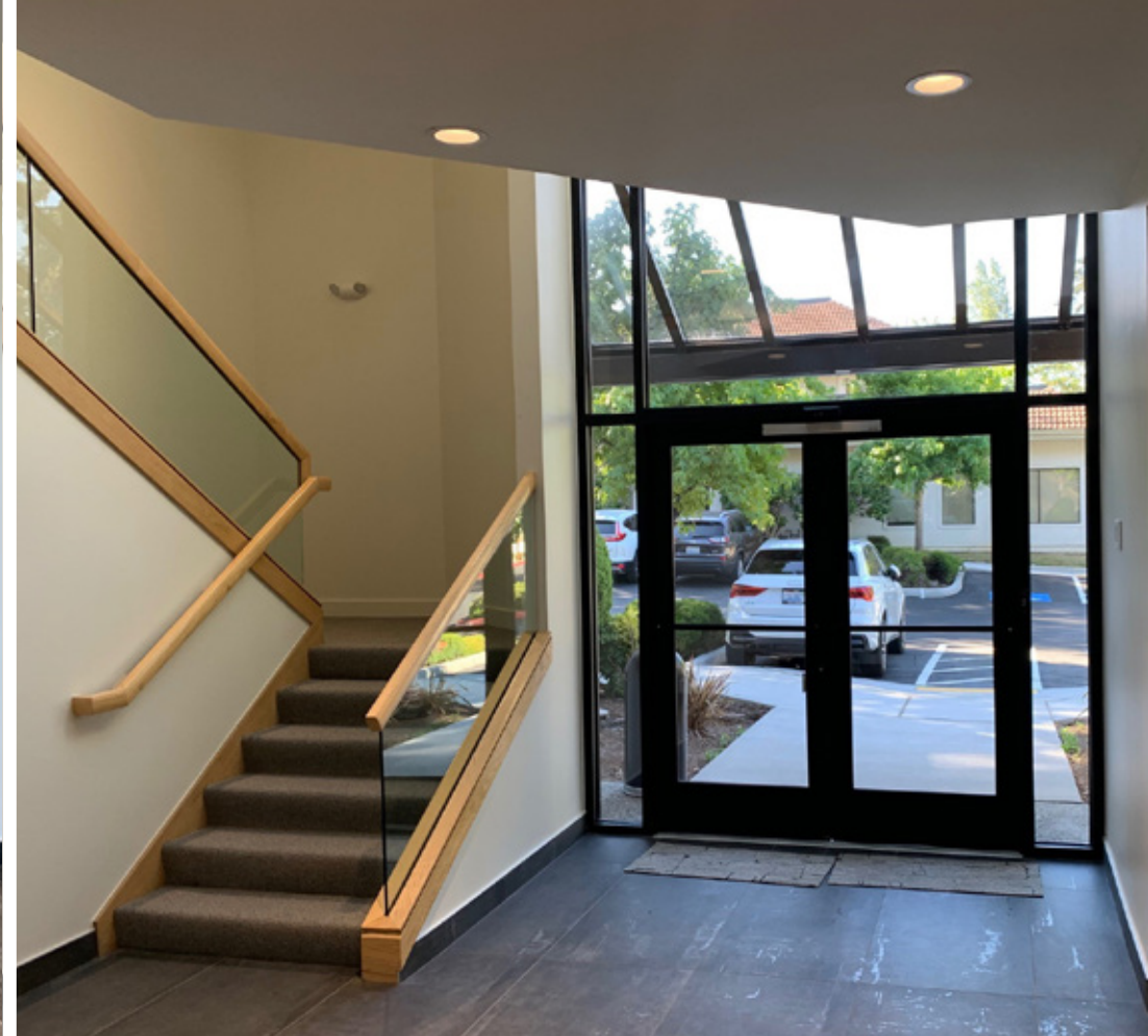
NEWLY IMPROVED LOBBY