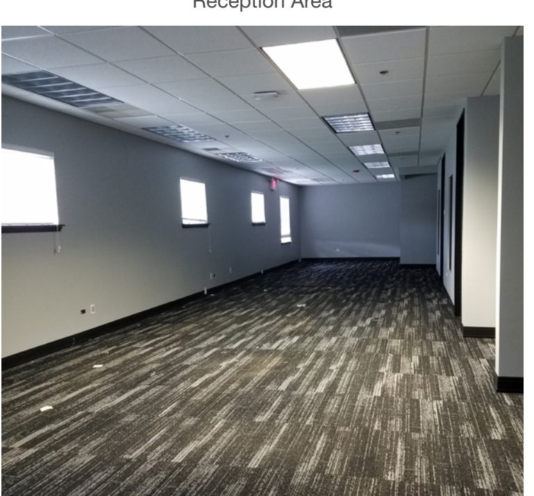
Large Open Area