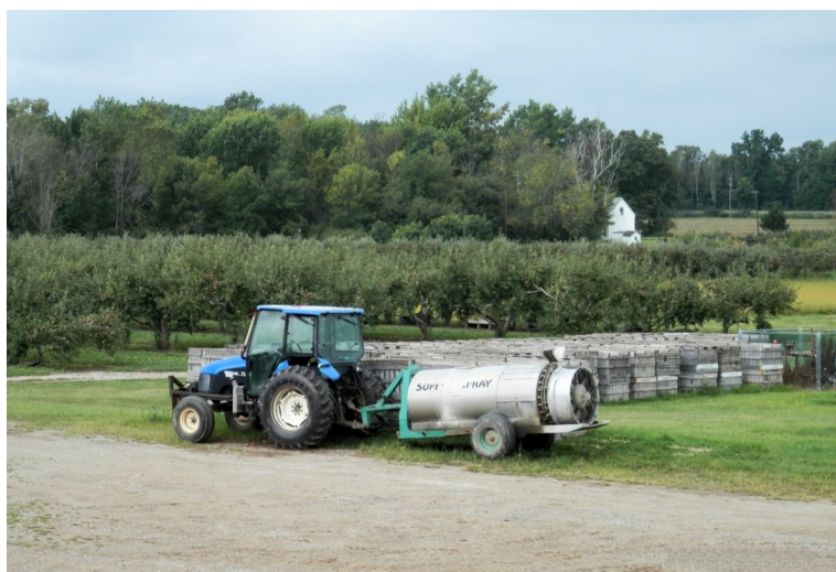
SUPER SPRAY SPRAYER