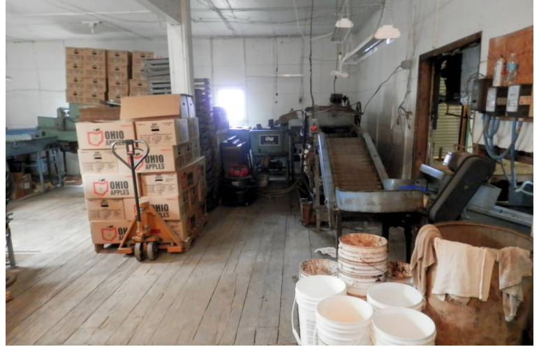
WASH & WAX LINE