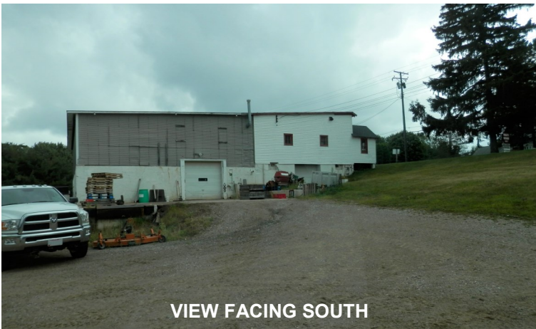
VIEW FACING SOUTH