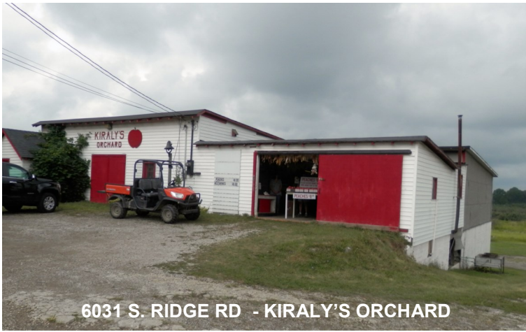
6031 S. RIDGE RD - KIRALY'S ORCHARD

Saybrook Township, Ohio 44004 (Ashtabula County)