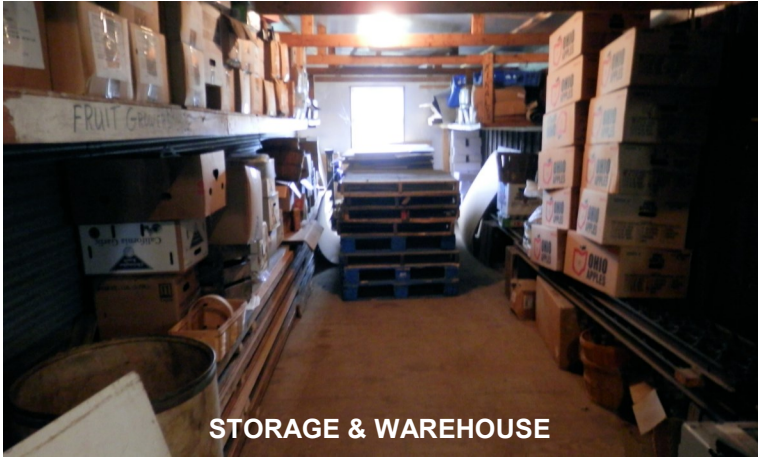
STORAGE & WAREHOUSE

6031 South Ridge Road (SR 84) and Brown Road Saybrook Township, Ohio 44004 (Ashtabula County)