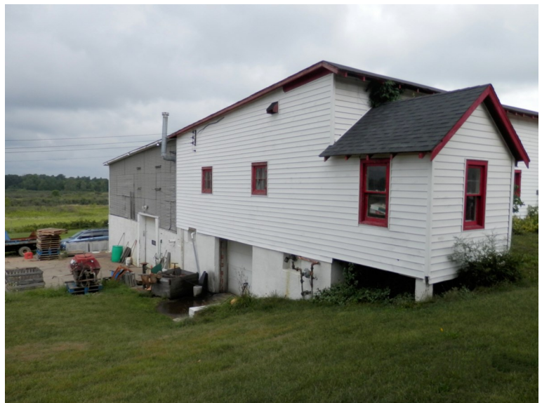
VIEWS FACING NORTH EAST