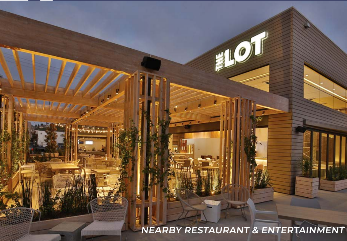
NEARBY RESTAURANT & ENTERTAINMENT