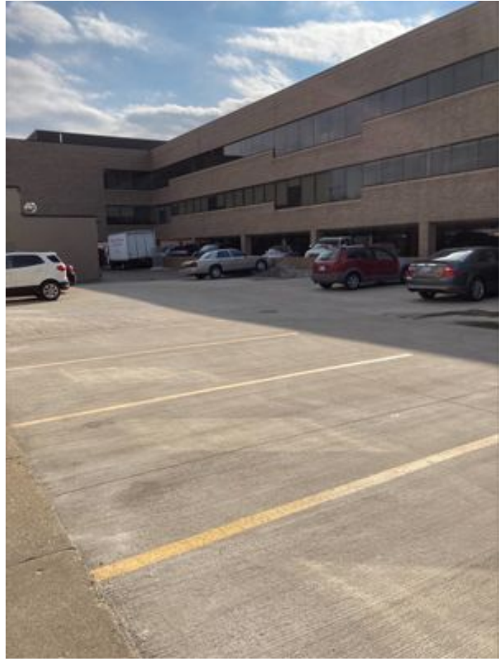
Parking Lot Photo