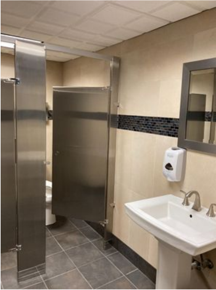
Interior Photo - Restrooms