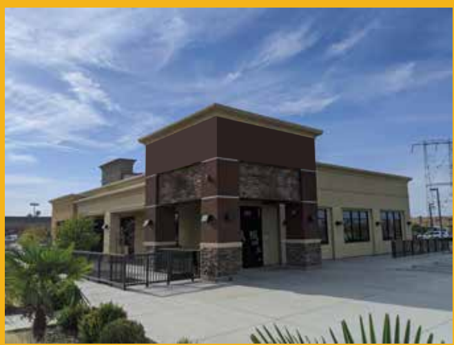
7919 E Brundage Lane