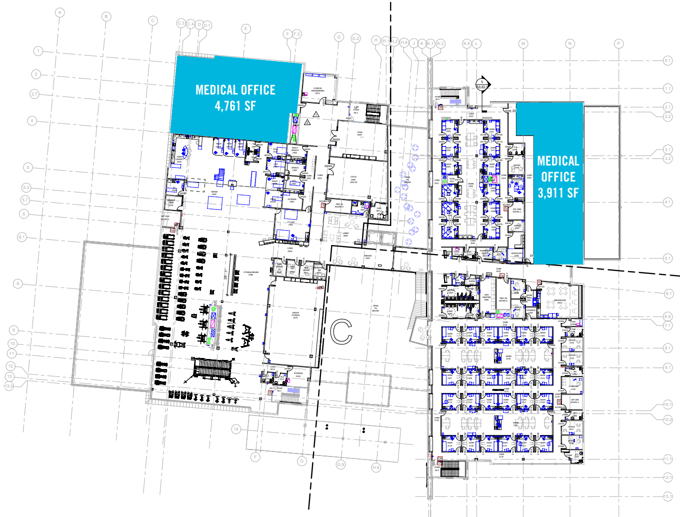
1 SECOND FLOOR NEW CONSTRUCTION PLAN 1/16" = 1'-0"

DISCLAIMER: THIS SITE PLAN SHOWS THE APPROXIMATE LOCATION, SQUARE FOOTAGE, AND CONFIGURATION OF THE FACILITY, AND IS ONLY ILLUSTRATIVE OF THE SIZE AND RELATIONSHIP OF THE SUITES AND COMMON AREAS GENERALLY, ALL OF WHICH ARE SUBJECT TO CHANGE. THE SHOWING OF ANY NAMES OF TENANTS, SQUARE FOOTAGE, SHALL NOT BE DEEMED TO BE A REPRESENTATION OR WARRANTY THAT ANY TENANTS WILL BE AT THE FACILITY, THE SQUARE FOOTAGE IS ACCURATE DO OR WILL CONTINUE TO EXIST.