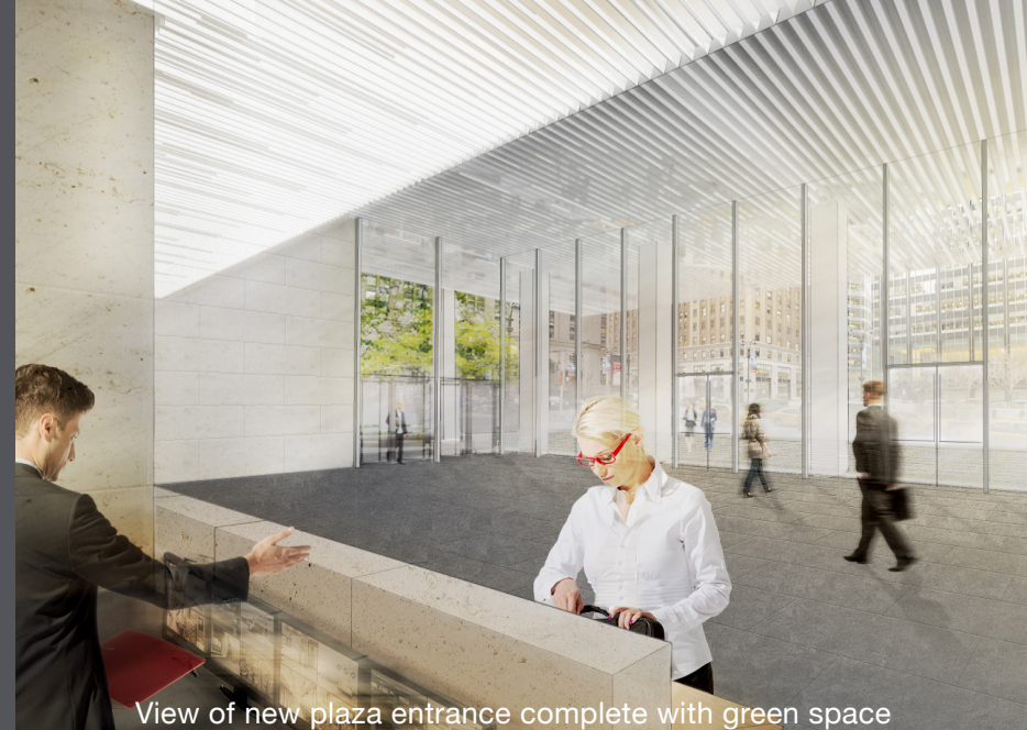
View of new plaza entrance complete with green space

For additional leasing information, please contact: