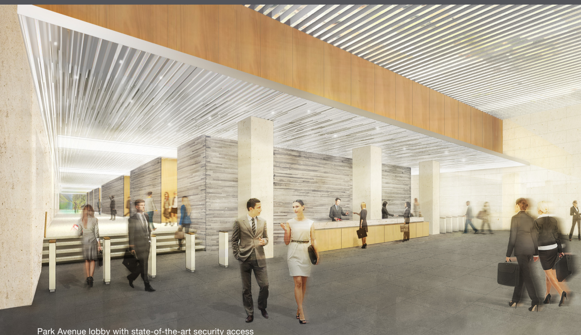
Park Avenue lobby with state-of-the-art security access