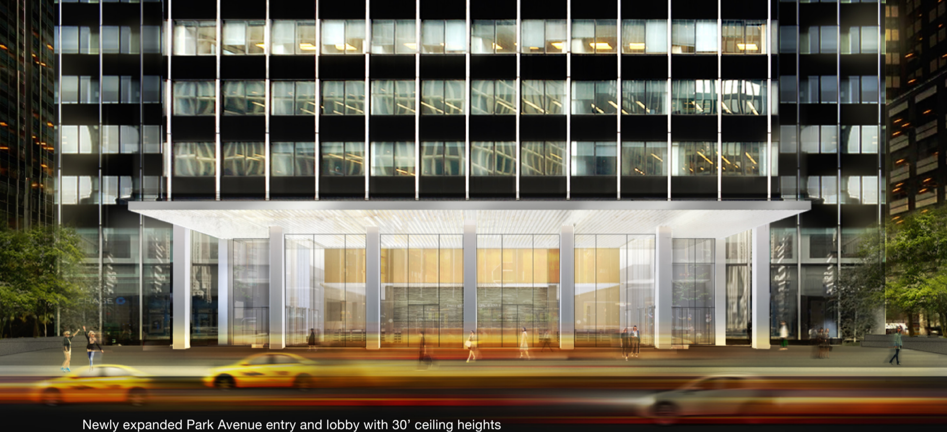
Newly expanded Park Avenue entry and lobby with 30' ceiling heights