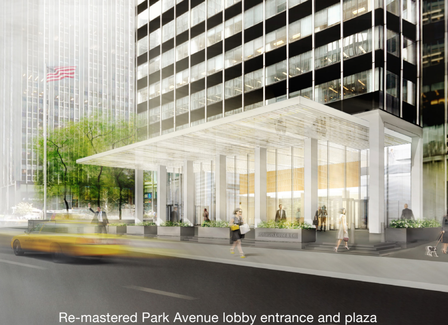
Re-mastered Park Avenue lobby entrance and plaza