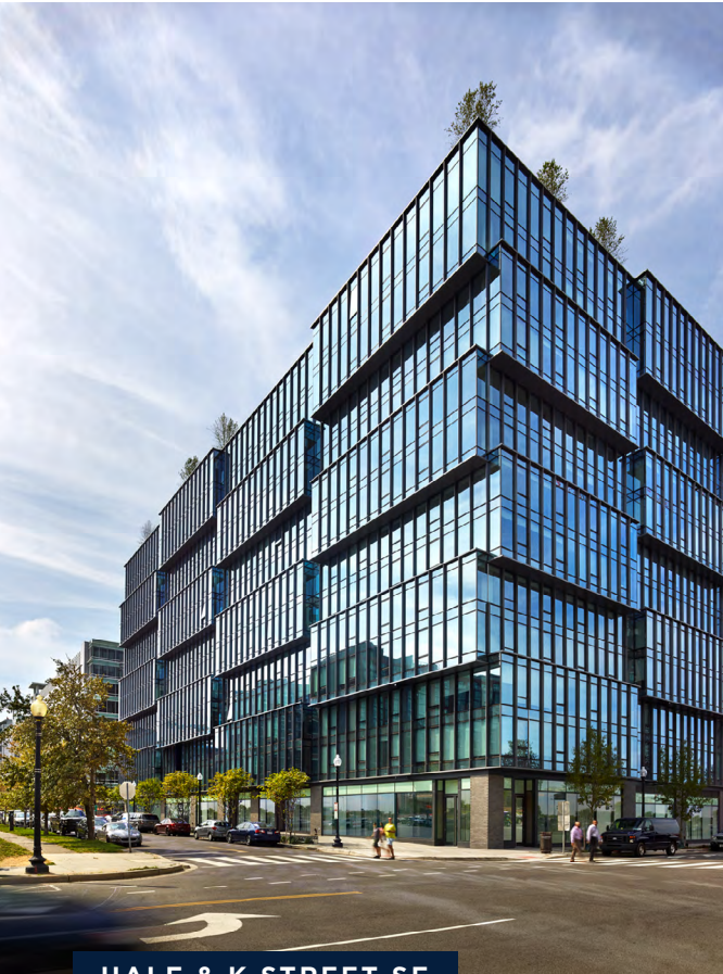
HALF & K STREET SE

Located four blocks from the Washington Nationals ballpark in the energetic Capitol Riverfront neighborhood, One Hill South is a new 13-story, high-end residential apartment building featuring ground-floor retail.