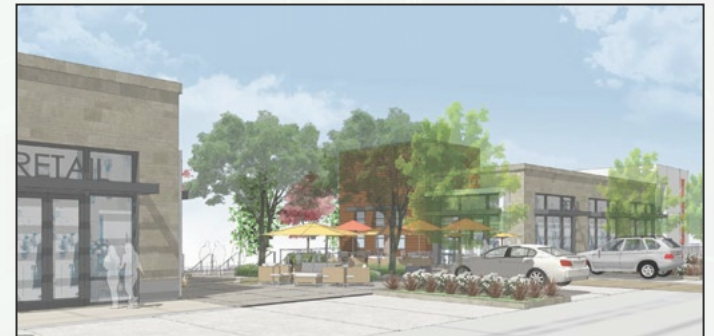
GROUND LEVEL PERSPECTIVE