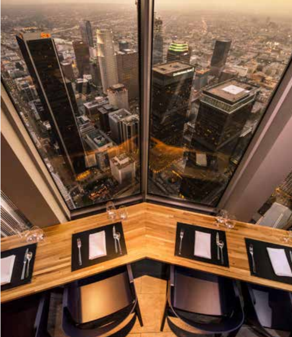
71 ABOVE RESTAURANT