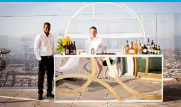
OBSERVATION DECK & PRIVATE EVENT SPACE ON FLOORS 69 & 70